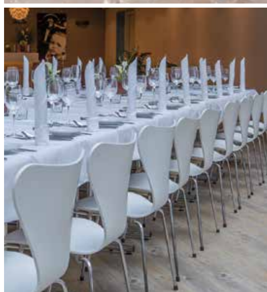
house of economics